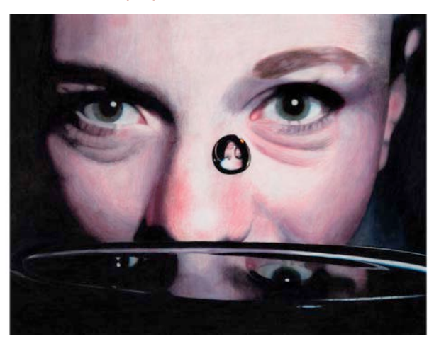
Three Self Portraits

won a national medal – for the most prestigious art show in the nation (the first TCA student so honored) won a Gold Key at the state level work displayed at Denver Art Museum